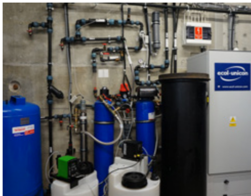
Domestic wastewater module ECOL-UNICON